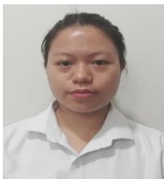
Datliam Matey Leela Bhartiya City, Bangalore