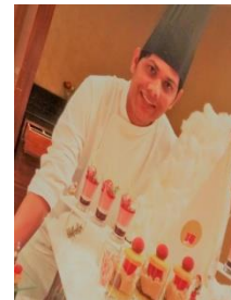
Pinku Kurmi Banana Island Resort, Doha