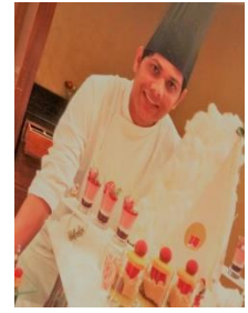
Pinku Kurmi Banana Island Resort, Doha