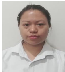
Datliam Matey Leela Bhartiya City, Bangalore